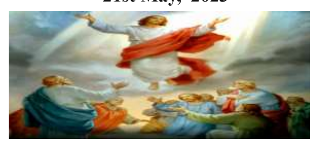
Authority in heaven and on earth is given to Jesus

During these weeks between Easter and Pentecost we have had a chance to reflect on the difference that Jesus' death, resurrection and ascension make on our lives. We have read from the Book of Acts during these weeks and have seen how the early church struggled and survived during its first critical days. This early Christian community was mission-minded, wanting to go out immediately to tell others the good news.